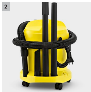
2 Practical cord and accessories storage