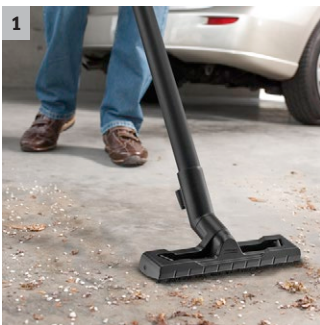
1 Optimally developed floor nozzle